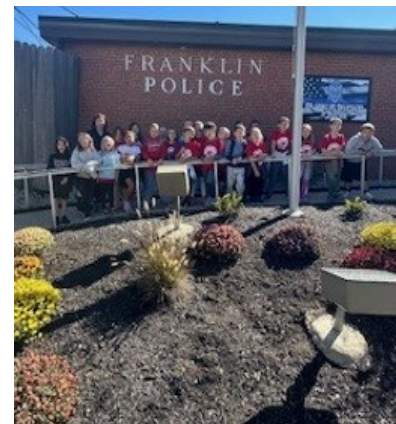
Third graders from Franklin Intermediate School recently enjoyed their Franklin Walking Field Trip. Students visited the Harding Museum, the Log Cabin Post Office, the Police Station, the Fire Station, and the City Building. They had a wonderful day learning about our city! Many thanks to the community partners who helped make this a great day for our students.