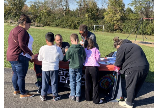
Hunter Elementary's Fall Family Literacy event drew a huge crowd — 416 — who enjoyed food, a hayride, bounce houses, games, a pumpkin patch, and other family activities.