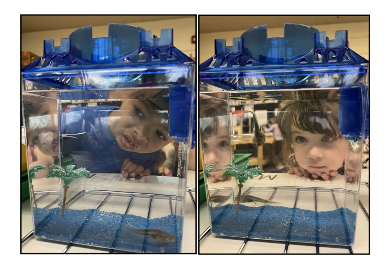
At Schenck , preschool students watched their tadpoles, Bubbles and Backpack, mature into frogs!

First graders made a field trip to the Cincinnati Zoo (left), and fifth and sixth graders (above) visited Great American Ballpark.